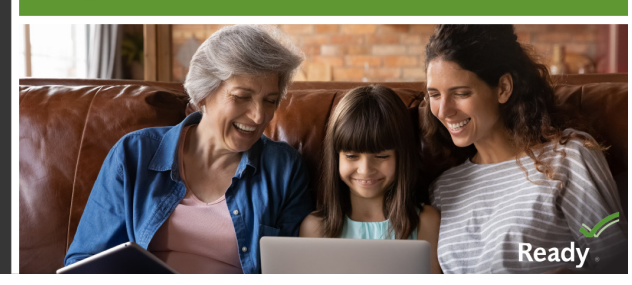
National Preparedness Month (NPM)

National Preparedness Month is an observance each September to raise awareness about the importance of preparing for disasters and emergencies that could happen at any time. The 2021 theme is "Prepare to Protect. Preparing for disasters is protecting everyone you love."