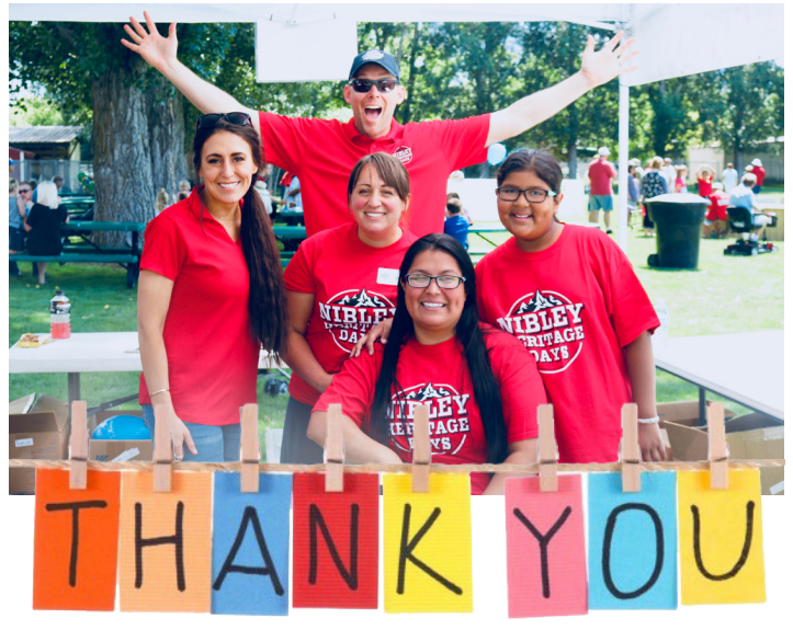
Heritage Days-Thank You!

We appreciate all the time and effort every volunteer offered in support of Nibley City Heritage Days. The combined effort of support from amazing volunteers, local businesses, interns, and city staff makes each year's Heritage Days community events possible. We want to thank ALL of the volunteers who contributed their time and efforts to our city celebration. We especially want to thank the following who led the charge: