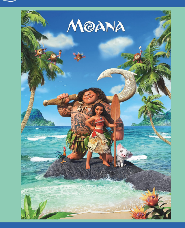
Sept 8th | Pre-Show Activities | Food | Family Fun

Back-to-School Movie in the Park—Enjoy Nibley's famous pre-show activities and some amazing islander food, and stay and watch this fun, family-friendly movie on Friday, September 8.